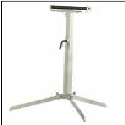
Bar support (Optional)