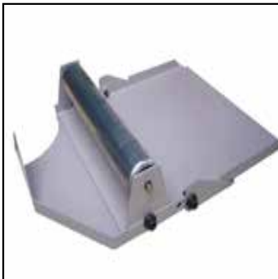
Connection for unloading table (Optional)

Connecting element for roller table for the loading side.