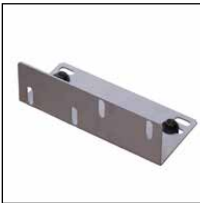
Connection element for unloading table (Optional )

Support element adjustable in height from 710 to 1100mm. Width 260mm, load 150kg.