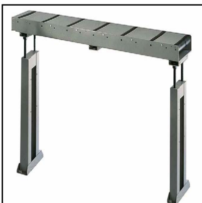
Loading/unloading table (Optional)

Connecting element for roller table for the unloading side.